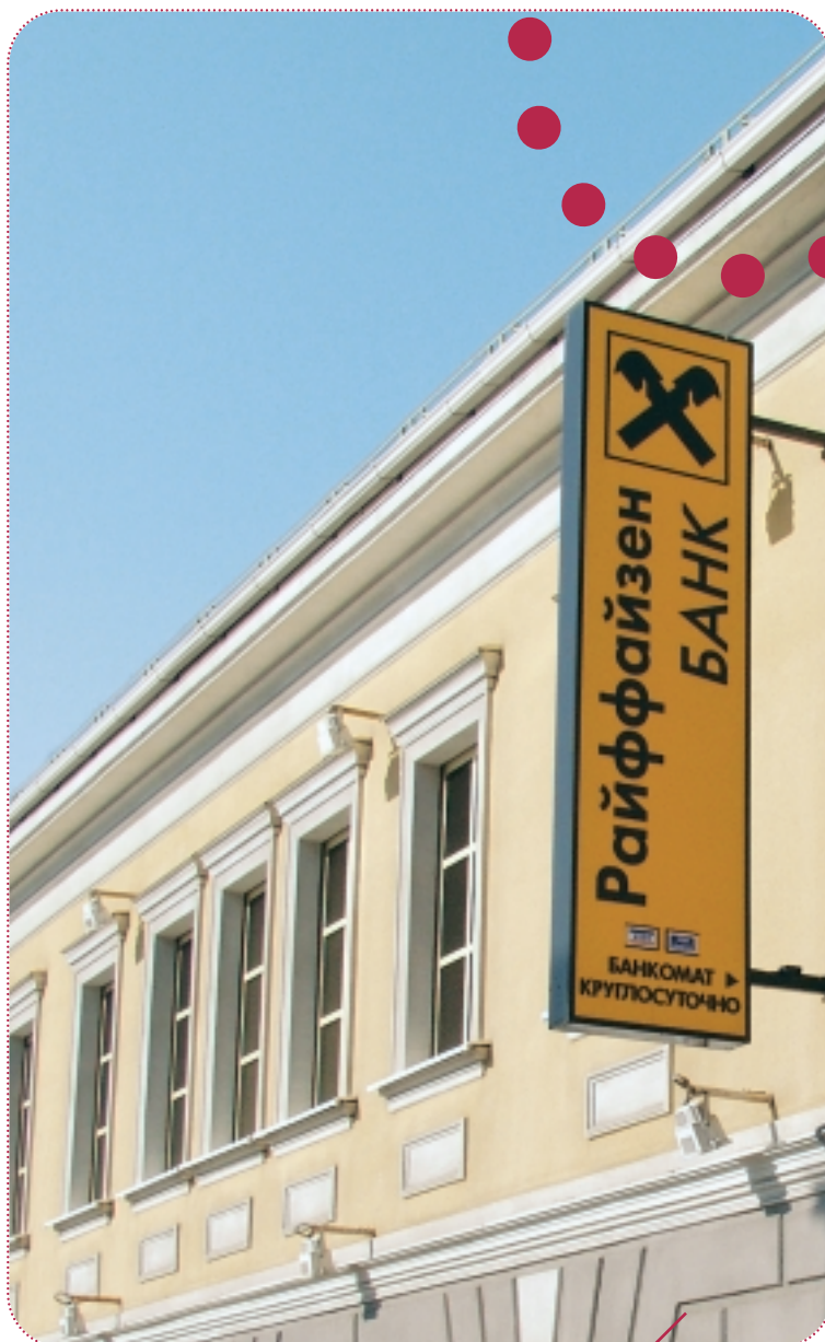
Raiffeisenbank Branch Tsarev Sad

● In addition to continuing to expand its core banking business, the Bank has also focused on the extension of its retail banking network. The Bank is increasingly active in handling bank cards, and during 2001 was responsible for handling 5% of the VISA interchange transaction turnover in Russia.