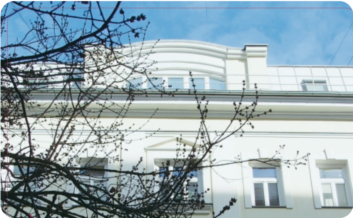
Raiffeisenbank Headquarters, Moscow